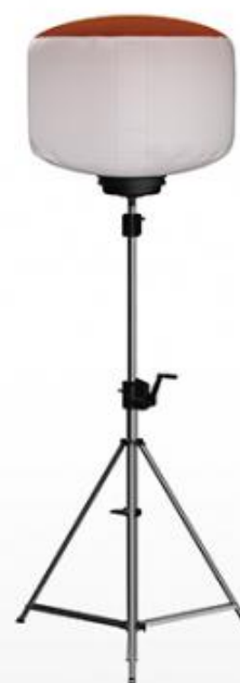
LED Balloon Light 500W~1400W