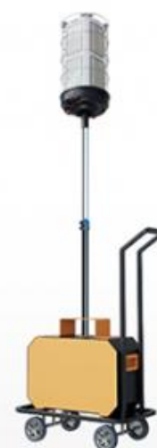
LED Balloon Light 60W~320W