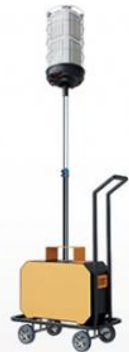
LED Balloon Light 60W~320W