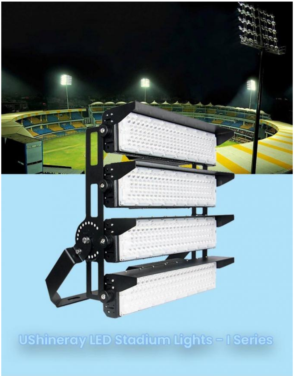
UShineray LED Stadium Lights - I Series