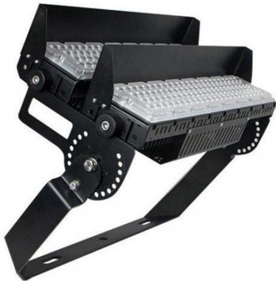
Three-Dimensional radiator, thickened aviation aluminum, corrosion resistance, high temperature resistance, fast heat dissipation.