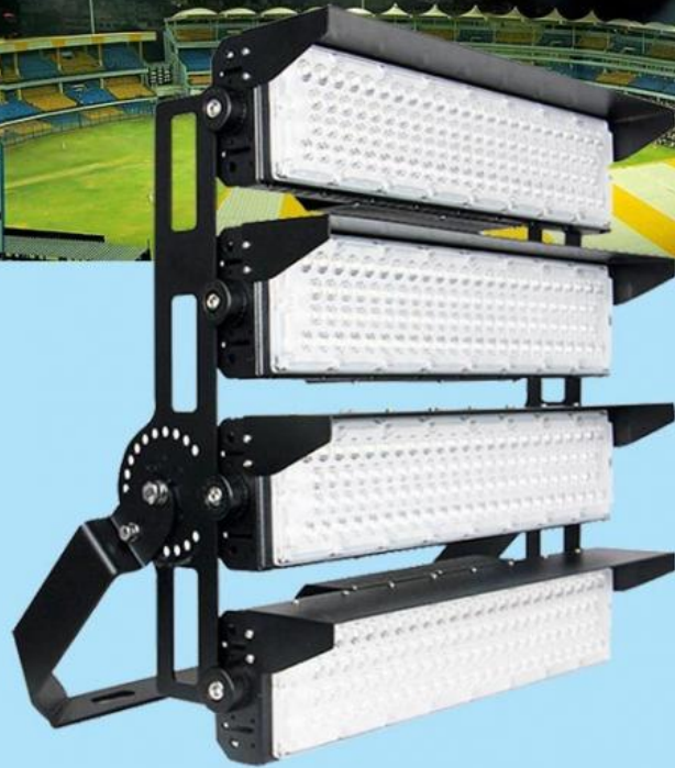
UShineray LED Stadium Lights - I Series