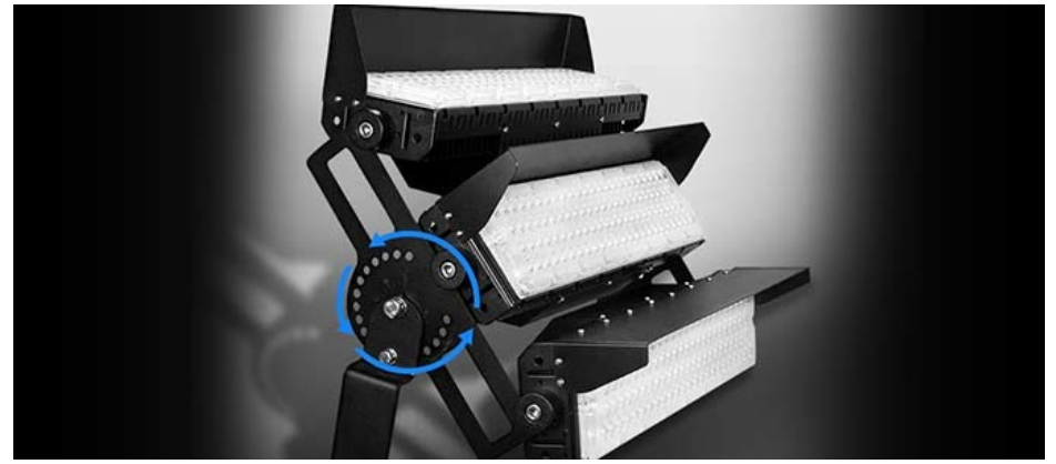
Single modular adjustable The whole lamp bracket is thickened and reinforced,it can be easily adjustable≥80°