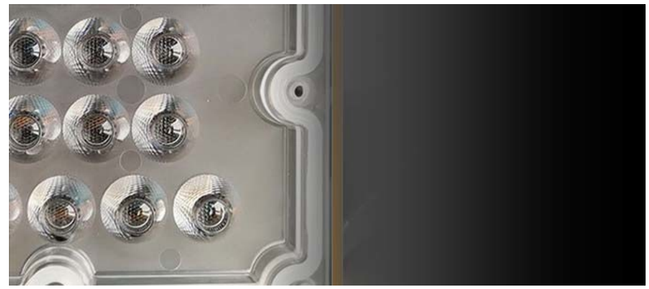
Optical lens No glare, high lumen 150lm/v