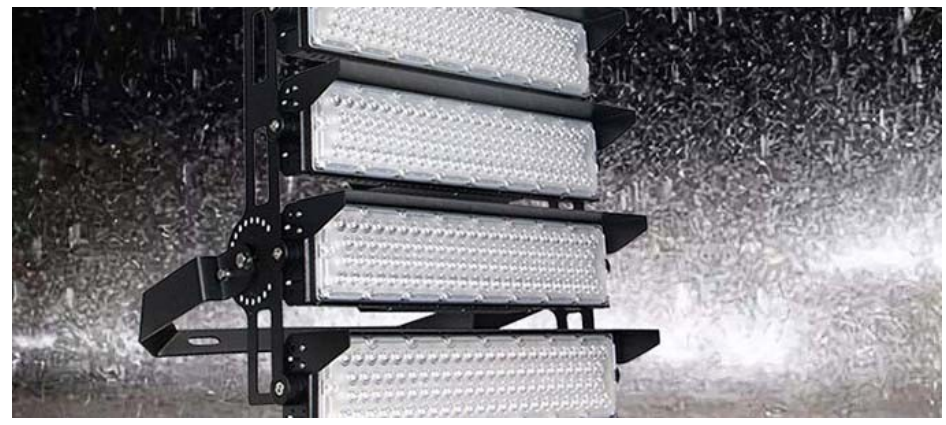
IP67 waterproof IP67 waterproof, surge protection 4KV-20KV.