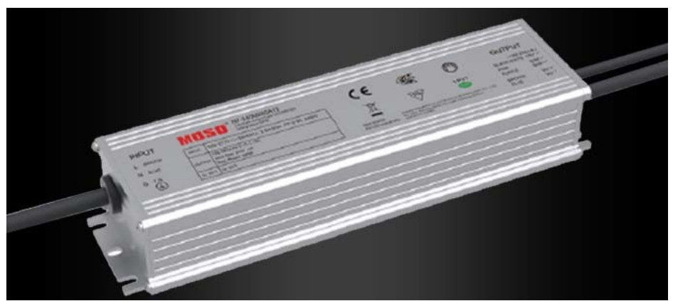
Famous brand Moso driver Lightning proof, explosion proof waterproof and dustproof: Effectively ensure the lamp LED chips continue to highlight; high stability flicker-free.