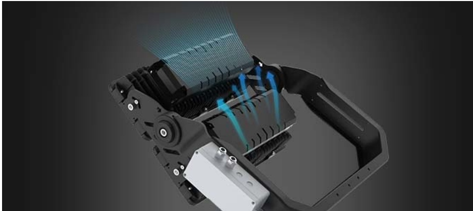
Excellent heat dissipation performance ADC12 die-casting aluminum heat sink, thermal conductivity aluminum substrate, fast heat dissipation, the efficiency is up to 96W/MK reduce light decay.