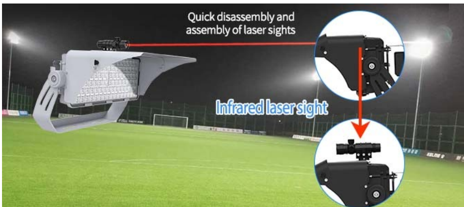
Infrared laser sight Quick disassembly and assembly of laser sights.