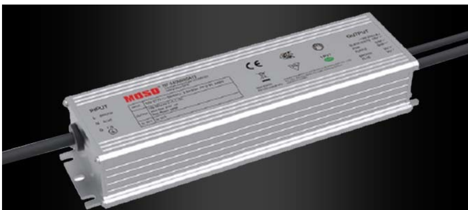
Brand Driver Famous brand Moso driver or other brand driver is optional, good stability, high efficiency, flicker free, anti-surge.