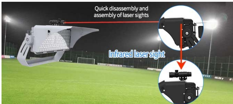
Infrared laser sight Quick disassembly and assembly of laser sights.