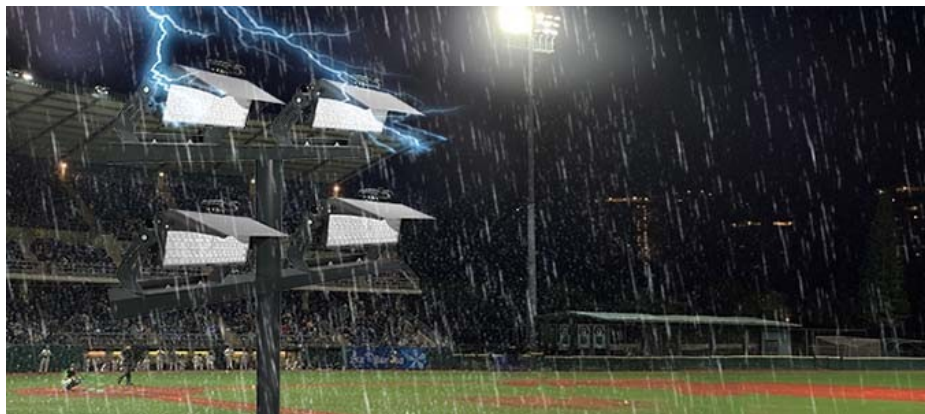
Whole lamp IP66 waterproof IP67 LED Driver, lamp with silicone waterproof sealing strip, UV-resistant material, reliable without failure.