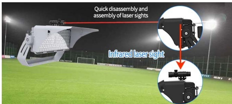
Infrared laser sight Quick disassembly and assembly of laser sights.