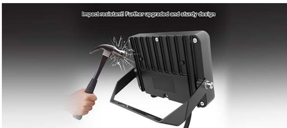
Impact resistant Further upgraded and sturdy design Adopts high hardness ADC12 aluminum alloy Aluminum shell with excellent heat dissipation. Lighting fixture has excellent impact resistance.