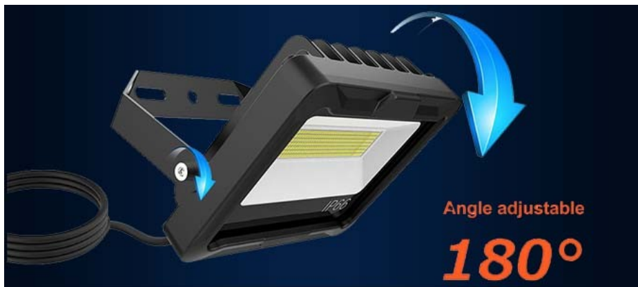
Angle adjustable The whole light can be adjusted 180°.