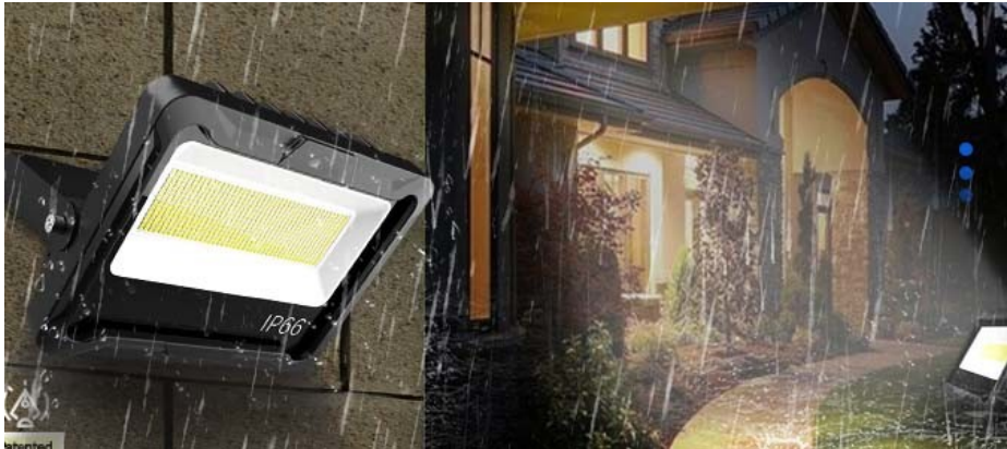
Waterproof and dust proof rating IP66 lamp with silicone waterproof sealing strip,UV-resistant material,excellent waterproof performance, no fear of harsh weather.