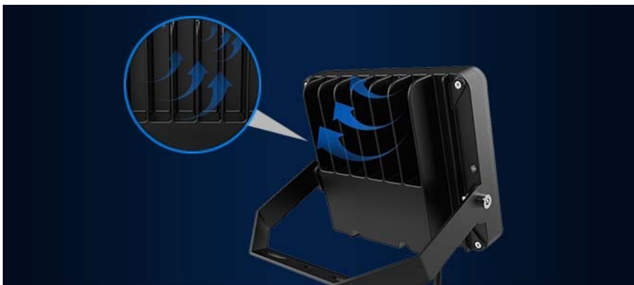
Heat-resistant aluminum material Heat-resistant aluminum is luxuriously used, and heat dissipation performance housing is about 50°C even after 3 hours of continuous lighting.