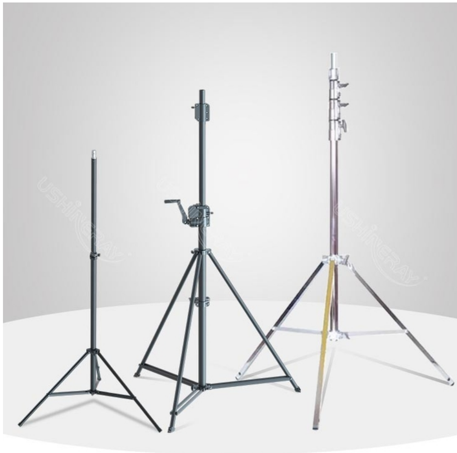
Multiple Options Balloon Light Tripods

Highly effective for Outdoor Activities, Search and Rescue, Parties and Special Events, Construction, Forensic Lighting, Road Construction and Maintenance, Fire & Rescue, Film Shooting, Landscaping, Temporary Lighting, Law Enforcement Support, Flagger Stations, Emergency Repairs, Farming and Agriculture, Camping, Disaster Relief, Mining.