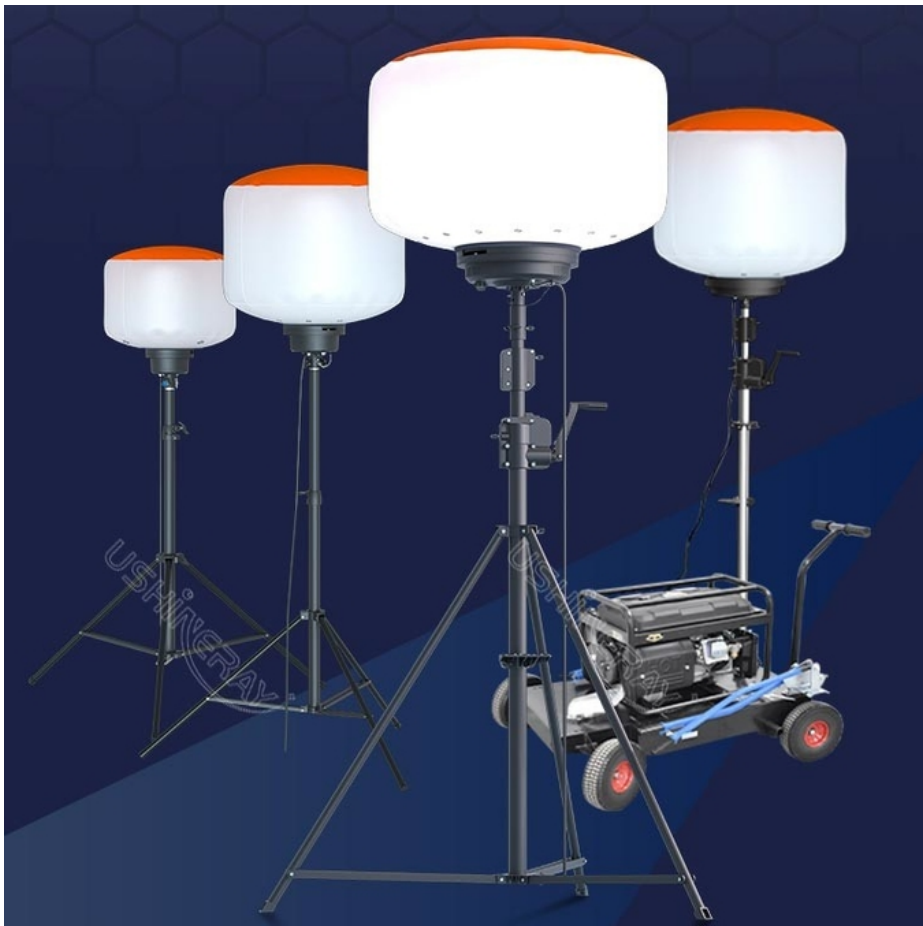
INDUSTRY-LEADING QUALITY AND PATENTED DESIGN