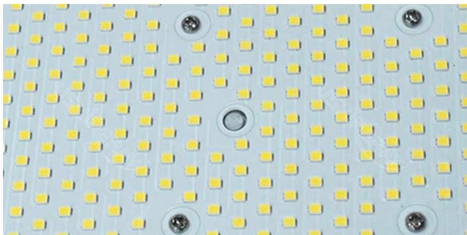
Brand Lumileds High Brightness LED Chips Low decay, longer span life.