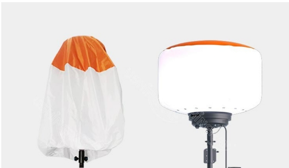
Self-Inflating Balloon Made of tear-resistant rip-stop fabric, offers 360-degree free lighting and inflates with one switch.