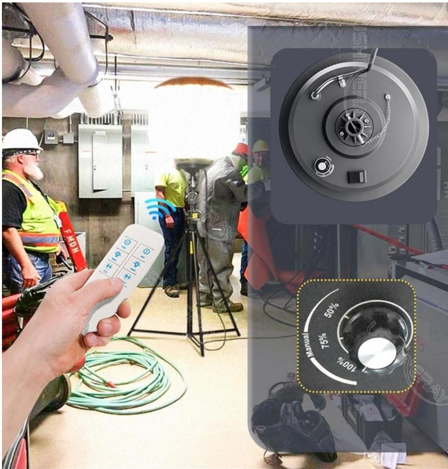
Dimmable; Remote control distance up to 60m, as well as with Brightness adjustment knob