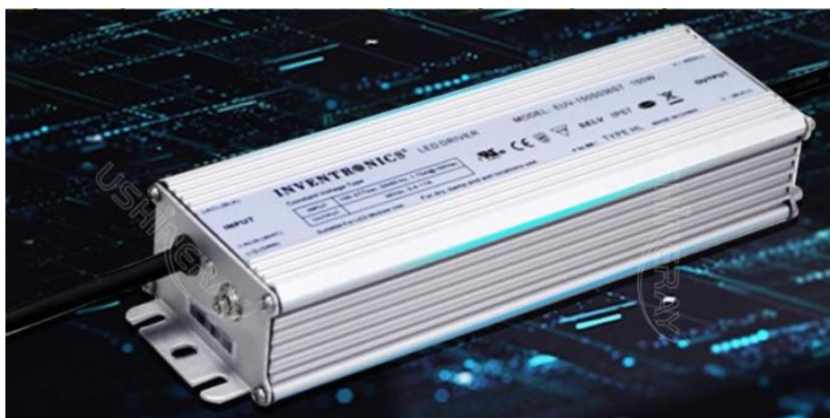
World famous brand Inventronics or Moso LED driver; Good stability, high efficiency, flicker free, anti-surge.