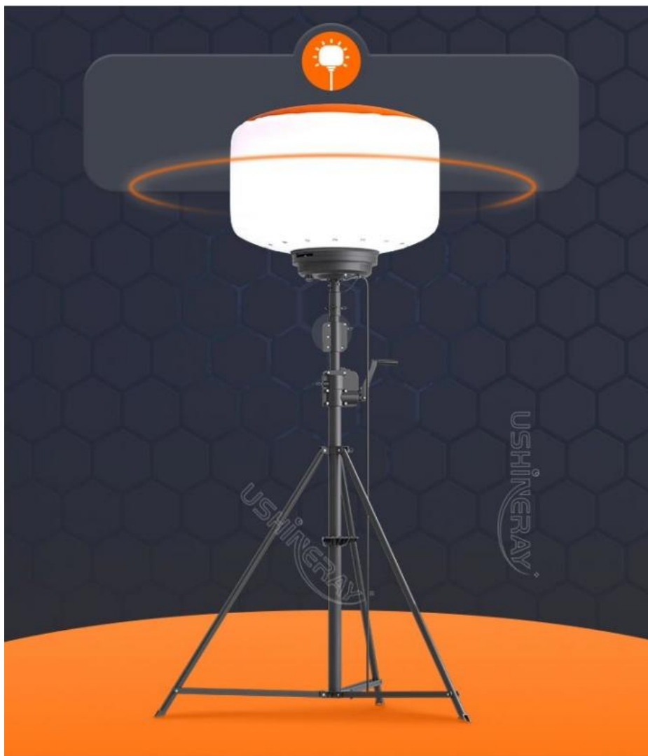
Inflatable LED Balloon Light 150W~1400W, wide area coverage with 360°illumination High Efficiency 160lm per watt NO stroboscope; No Glare; Easy Set; Vehicle-used; Dimmable; Rapid; Heat-dissipation; Diffused Light