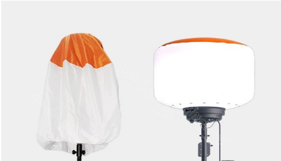
Self-Inflating Balloon Made of tear-resistant rip-stop fabric, offers 360-degree free lighting and inflates with one switch.