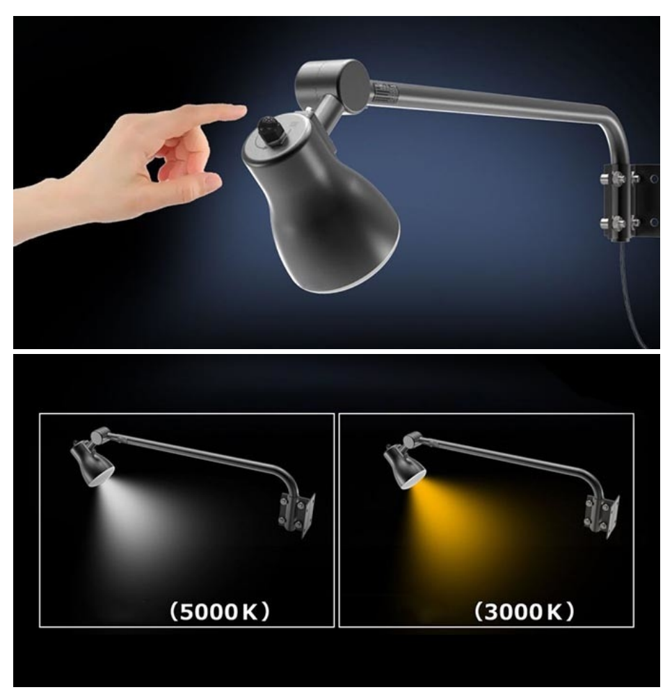
Dual color temperature adjustable

It can be easily changed with the switch on the arm, so it can be applied to various scenes 5000K Neutral White 3000K Warm White