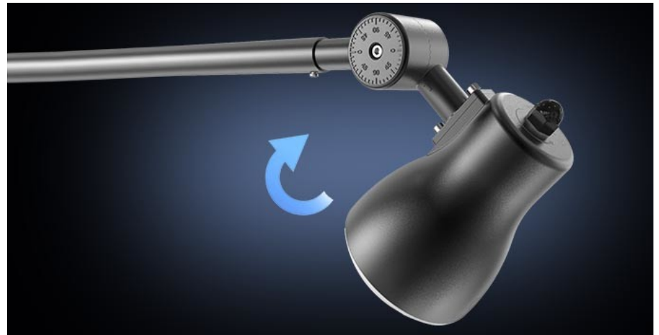
Equipped with a wheel irradiation angle can be adjustable. It can be installed at an appropriate irradiation angle according to the construction conditions and situation.