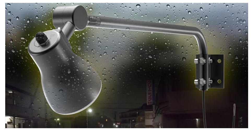
IP66 waterproof Factory-sealed water tight and IP66 rated for protection against high-pressure water jets and outdoor elements.