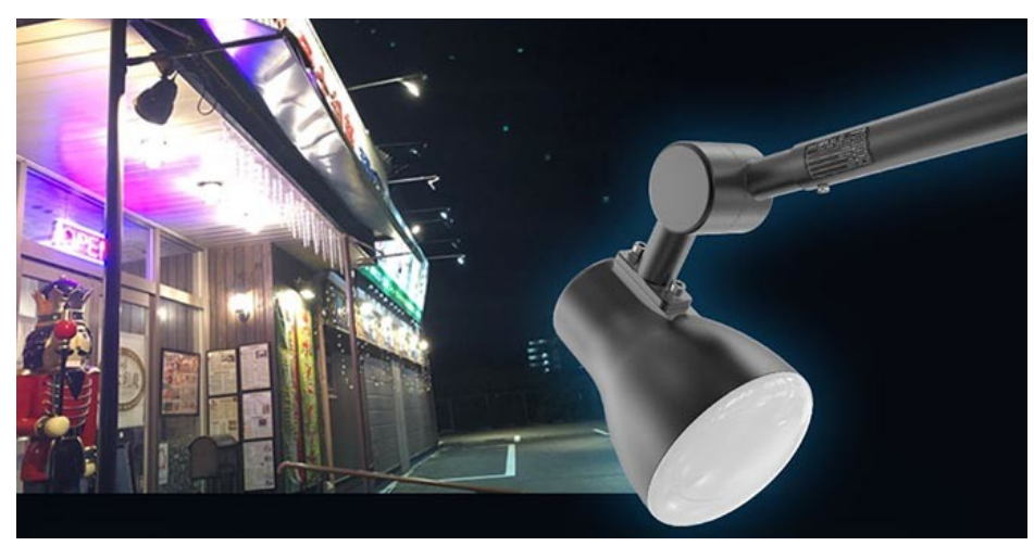
Arm length 856mm(Lamp+ Am length943.5cm) It is ideal as a signboard light for outdoor signboards and stores, optimal LED floodlight for landscape lighting and billboard lighting.