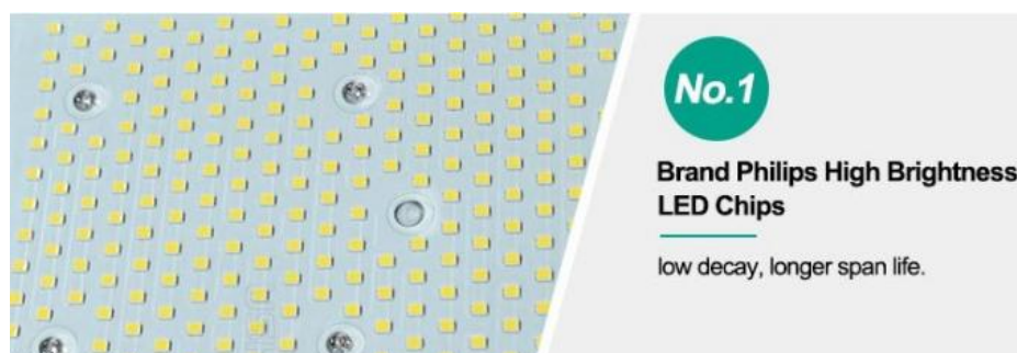
Brand chips high brightness, low decay, longer span life.