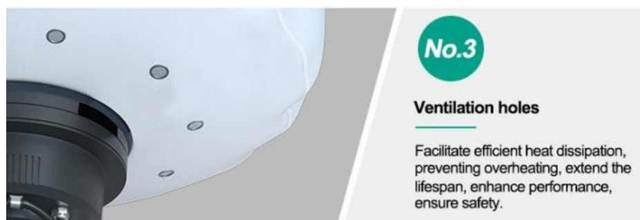
Ventilation holes. Facilitate efficient heat dissipation, preventing overheating, extend the lifespan, enhance performance, ensure safety.