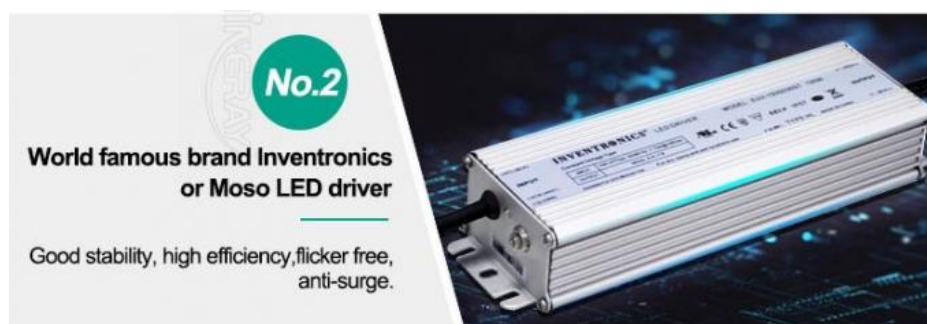
World famous brand Inventronics or Moso led driver Good stability, high efficiency, flicker free, anti-surge.