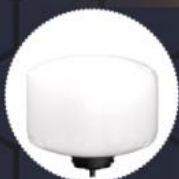
All White Diffuser