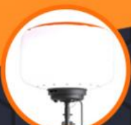
Top-reflective (Orange) Diffuser