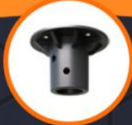
Tripod Adapter Optional