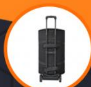
Carry case with trolley for Lamp